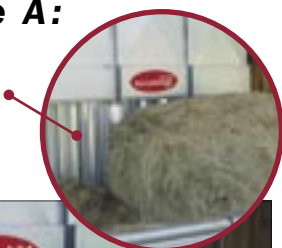
Type A, partition closed