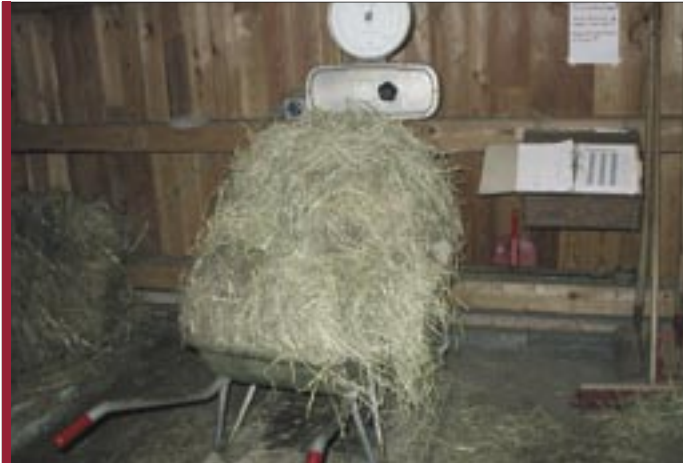
At the Government Research Institute FAL in Braunschweig-Völkenrode, the Horseking Hay Dispensers play an indispensable role in a wide-ranging investigation into natural forage uptake