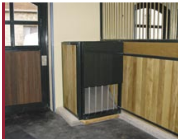
Exclusive hay dispenser in a new installation for stallions