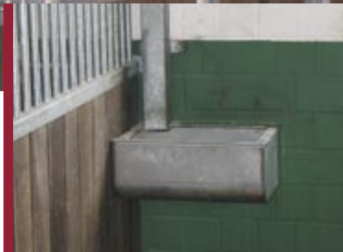
Dispensing pipe enters the feed trough